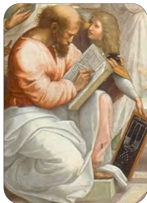
Pythagoras explaining his work (from The School of Athens , painted by Raphael around 1510).

This contradiction means our original assumption that there is a rational number whose square equals 2 was incorrect, completing the proof. ■