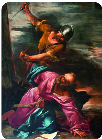
The death of Archimedes, as depicted in a seventeenth-century painting.

Let \mathbf{Z} denote the set of integers and \mathbf{Z}^+ denote the set of positive integers. Thus