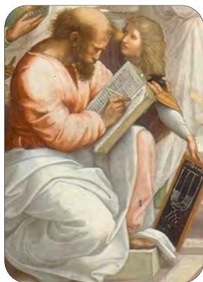
Pythagoras explaining his work (from THE SCHOOL OF ATHENS, painted by Raphael around 1510.)

There does not exist a rational number whose square equals 2.