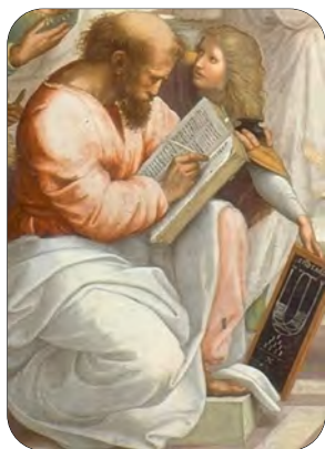
Pythagoras explaining his work (from THE SCHOOL OF ATHENS, painted by Raphael around 1510.)

There does not exist a rational number whose square equals 2.