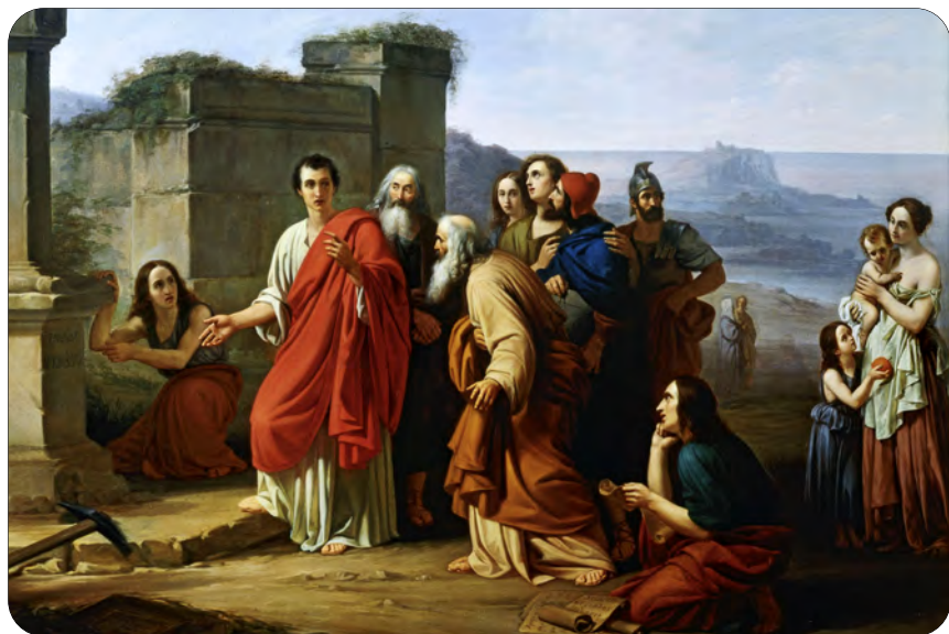
Nineteenth-century painting of Cicero discovering the tomb of Archimedes. In Section C we will see how the Archimedean Property of the real numbers follows from the completeness property.

The last section of this appendix contains several major results from elementary real analysis. We will prove the Bolzano–Weierstrass Theorem, which is then used as a key tool for results concerning uniform continuity and maxima/minima of continuous functions on closed bounded subsets of \mathbf{R}^n .